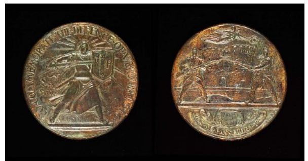
Paul Manship, Defense of Verdun Medal (front and reverse), 1920, bronze, 4 in. diam., Gift of the artist, 1965.16.88.

For a full-size image of Paul Manship's Defense of Verdun Medal , visit: http://americanart.si.edu/images/1965/1965.16.88A-B_1a.jpg