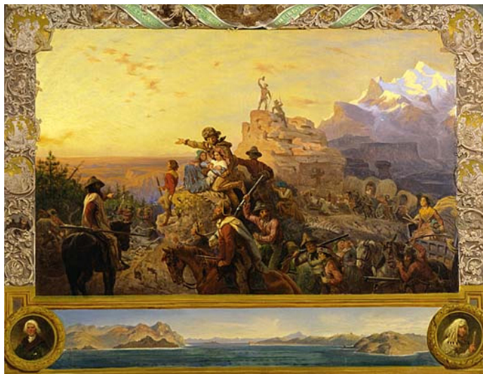
Emanuel Gottlieb Leutze, Westward the Course of Empire Takes Its Way (mural study, U.S. Capitol) , 1861, oil on canvas, 33 1/4 x 43 3/8 in., Bequest of Sara Carr Upton, 1931.6.1.