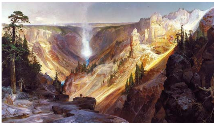
Thomas Moran, The Grand Canyon of the Yellowstone , 1872, oil on canvas mounted on aluminum, 84 x 144 1/4 in., Lent by the Department of the Interior Museum, L.1968.84.1.

Many artworks in our collection support this videoconference. A representative sample appears below. Please note that images used during your videoconference may vary.