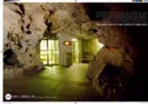
Center for Land Use Interpretation, Subterranean Renovations: The Unique Architectural Spaces of Show Caves , 1998, inkjet poster, 17 x 24 inches, Courtesy of Center for Land Use Interpretation, Culver City, Calif.