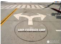
Center for Land Use Interpretation, Loop Feedback Loop: The Big Picture of Traffic Control in Los Angeles , 2004, inkjet poster, 17 x 24 inches, Courtesy of Center for Land Use Interpretation, Culver City, Calif.