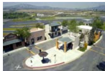
Center for Land Use Interpretation, Emergency State: First Responder & Law Enforcement Training Architecture , 2004, inkjet poster, 17 x 24 inches, Courtesy of Center for Land Use Interpretation, Culver City, Calif.