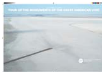
Center for Land Use Interpretation, Tour of the Monuments of the Great American Void , 2004, inkjet poster, 17 x 24 inches, Courtesy of Center for Land Use Interpretation, Culver City, Calif.