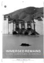
Center for Land Use Interpretation, Immersed Remains: Towns Submerged in America , 2005, inkjet poster, 24 x 17 inches, Courtesy of Center for Land Use Interpretation, Culver City, Calif.