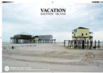
Center for Land Use Interpretation, Vacation: Dauphine Island , 2006, inkjet poster, 17 x 24 inches, Courtesy of Center for Land Use Interpretation, Culver City, Calif.