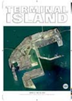
Center for Land Use Interpretation, Terminal Island , 2005, inkjet poster, 24 x 17 inches, Courtesy of Center for Land Use Interpretation, Culver City, Calif.