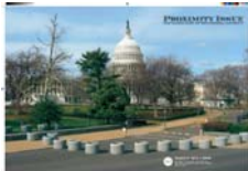
Center for Land Use Interpretation, Proximity Issue: The Barricades of the Federal District , 2002, inkjet poster, 17 x 24 inches, Courtesy of Center for Land Use Interpretation, Culver City, Calif.