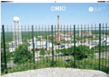
Center for Land Use Interpretation, Ohio , 2002, inkjet poster, 17 x 24 inches, Courtesy of Center for Land Use Interpretation, Culver City, Calif.