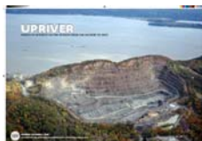
Center for Land Use Interpretation, Upriver: Points of Interest on the Hudson from the Battery to Troy , 2006, inkjet poster, 17 x 24 inches, Courtesy of Center for Land Use Interpretation, Culver City, Calif.