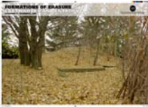
Center for Land Use Interpretation, Formations of Erasure: Earthworks and Entropy , 2000, inkjet poster, 17 x 24 inches, Courtesy of Center for Land Use Interpretation, Culver City, Calif.