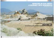
Center for Land Use Interpretation, Margins in our Midst: A Journey into Irwindale , 2003, inkjet poster, 17 x 24 inches, Courtesy of Center for Land Use Interpretation, Culver City, Calif.