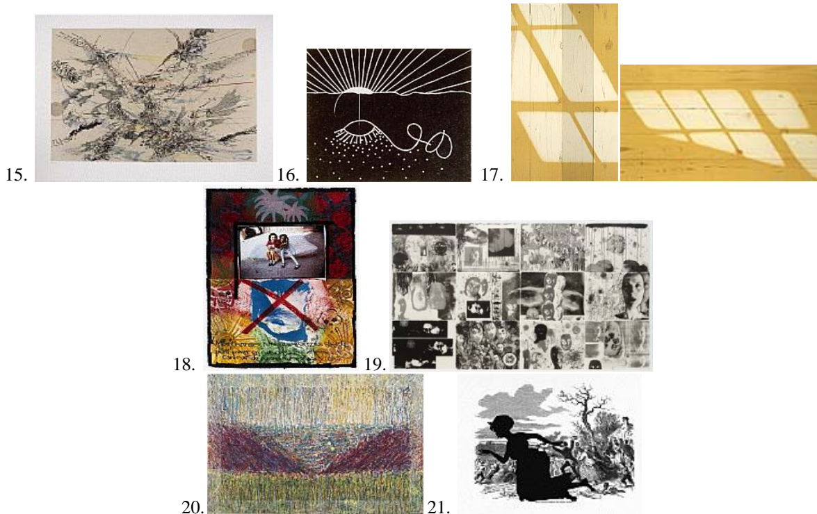
15. Julie Mehretu, Local Calm , 2005 color aquatint, etching, and engraving on Gampi paper chine collé, Smithsonian American Art Museum, Museum purchase through the Lichtenberg Family Foundation, © 2005 Julie Mehretu