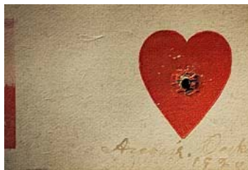
Annie Leibovitz, Annie Oakley's heart target, private collection, Los Angeles, California, 2010, From “Pilgrimage” (Random House, 2011)