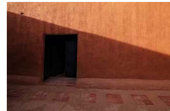
Annie Leibovitz, Door in adobe wall at Georgia O'Keeffe's home in Abiquiu, New Mexico, 2011, From “Pilgrimage” (Random House, 2011)