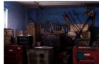
Annie Leibovitz, Martha Graham Center of Contemporary Dance warehouse, Yonkers, New York, 2010, From “Pilgrimage” (Random House, 2011)