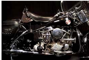
Annie Leibovitz, Elvis's 1957 Harley-Davidson Hydra Glide motorcycle, Graceland, Memphis, Tennessee, 2011, From “Pilgrimage” (Random House, 2011)