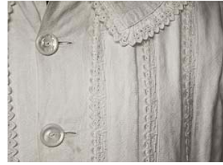
Annie Leibovitz, Emily Dickinson's only surviving dress, Amherst Historical Society, Amherst, Massachusetts, 2010, From “Pilgrimage” (Random House, 2011)