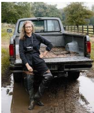
Annie Leibovitz, Plano, Illinois, 2011.