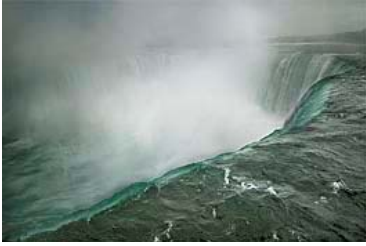
Annie Leibovitz, Niagara Falls, Ontario, Canada, 2009, From “Pilgrimage” (Random House, 2011)