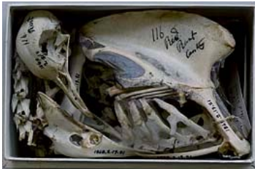
Annie Leibovitz, Skeleton of a pigeon studied by Charles Darwin, Natural History Museum at Tring, Hertfordshire, England, 2010 , © Annie Leibovitz. From “Pilgrimage” (Random House, 2011)