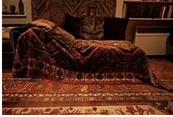
Annie Leibovitz, Sigmund Freud's couch, Freud Museum, 20 Maresfield Gardens, London, 2009 , © Annie Leibovitz. From “Pilgrimage” (Random House, 2011)