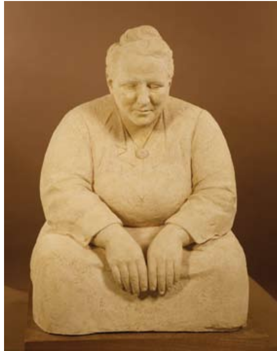
JO DAVIDSON ◀ Gertrude Stein

Sculptor Jo Davidson portrayed this impresario of modernism as “a sort of modern Buddha” because he believed she “symbolized wisdom.” Third Floor, Twentieth-Century Americans